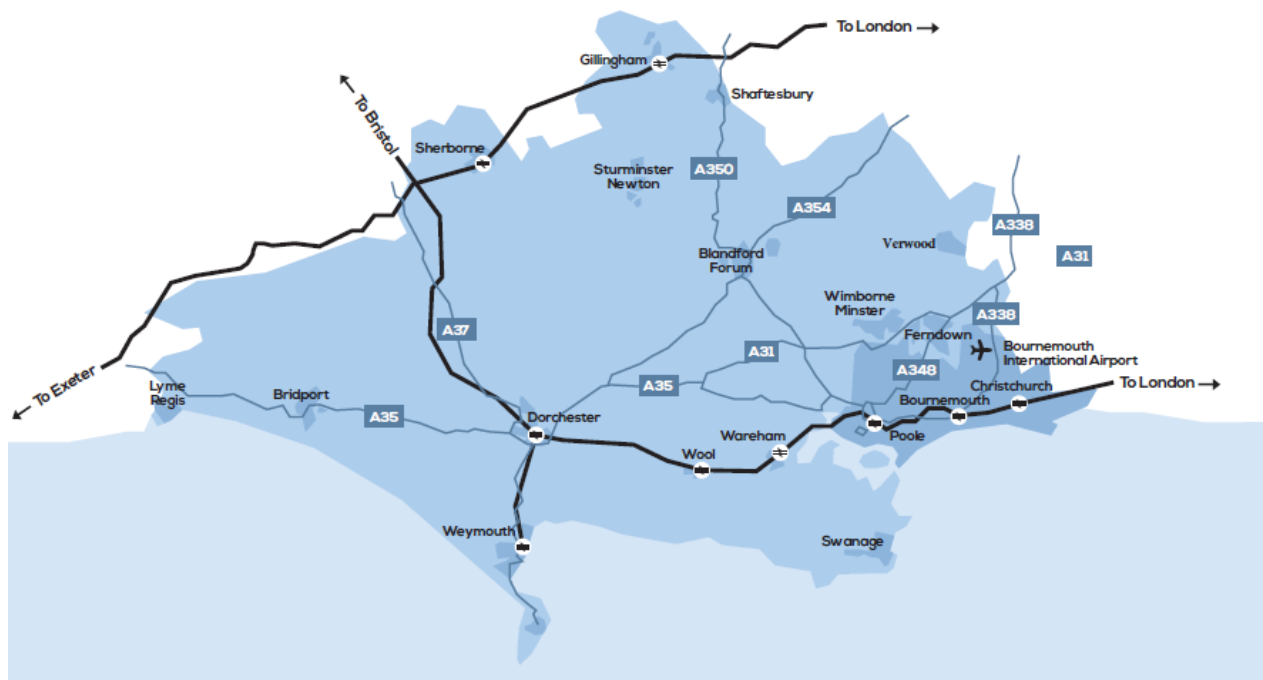
Figure 1 Map of Dorset